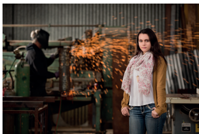
Without OCF Grid