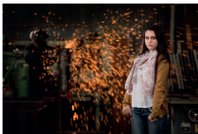
With OCF Grid